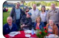
Welcome CPMB Westman—Committee and Members from Brandon and Boissevain

On August 8, 2024, CPMB Family and Friends gathered to celebrate 50 years of the Cerebral Palsy Association of Manitoba's success! THANK YOU Members, Sponsors and Volunteers—we could not do this without you! #CPProud